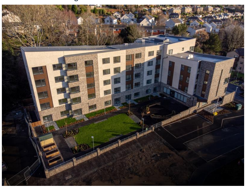
Figure 12: Wilkie Gardens Extra Care Housing Galashiels

Eildon Housing Association is also working in partnership with M&J Ballantyne Ltd to provide 36 Extra Care Flats as one element of the regeneration of the site of the former High School in Kelso. The Council has agreed to grant assist the Association up to £0.750m using Second Homes Council Tax Funding. Site works started in March 2021, with estimated completion around spring 2023. The Association is also progressing