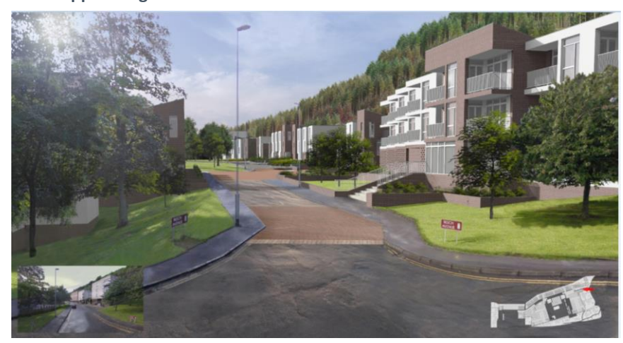
Figure 11: Beech Avenue Upper Langlee Galashiels