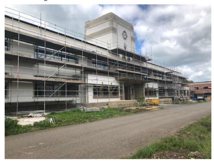
Figure 13: Proposed Extra Care Housing Kelso

The Council is carrying out a number of reviews covering Council budgets, corporate priorities and Capital Programme. At the time of writing, it is not possible to provide any timelines against these reviews. This may have implications for the re-development of the former High School site in Eyemouth where there has been some progress made towards reconciling a number of development ambitions through a Council-led master-planning approach. Redevelopment of this site identifies the potential provision of a 36 flat Extra Care Housing development plus some Elderly Amenity housing, thereby replicating the approach previously undertaken at Todlaw Duns. However the affordable housing projects have stalled because the Council is currently carrying out a public consultation exercise regarding options for the provision of the Primary School. The anticipated resolution of the master-planning challenges will also provide more certainty regarding the design and programming the delivery of the Berwickshire Housing Association project elsewhere on the former High School site.