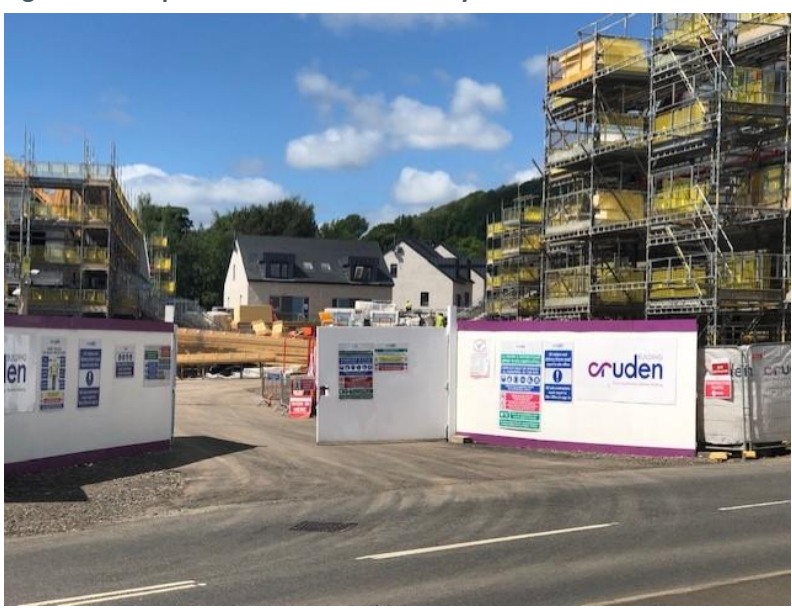
Figure 14: Coopersknowe Galashiels - May 2022

There are no house builder firms of any significant size based in Berwickshire. That aside, Berwickshire Housing Association is also keen to encourage "out of Borders" based house builders such as Crudens and Springfield Homes, and it contracts with both, to contract with local sub-contractors in order to maximise the economic impact of its affordable housing construction projects.